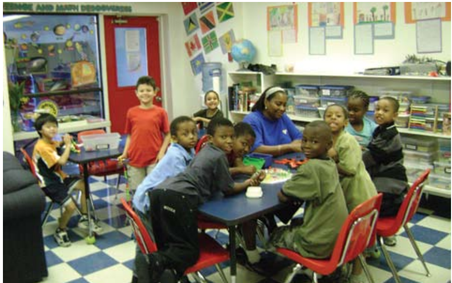
Caring staff, colourful surroundings and a wide variety of activities keep the children at Kindercroft smiling.

longevity in the child care business in part to her membership in ADCO. "It gives independent operators like myself a real sense of community, provides us with practical support when we're dealing with policy issues and helps us stay up-to-date on trends that affect our work." In addition to joining ADCO, her best advice to other child care owners and managers is as follows: "Professional supervisors and qualified teach-